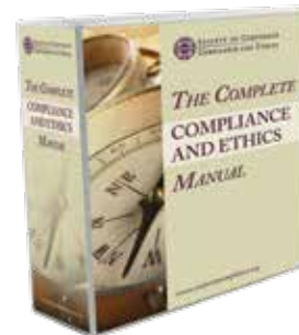
The Complete Compliance and Ethics Manual (normally $399)