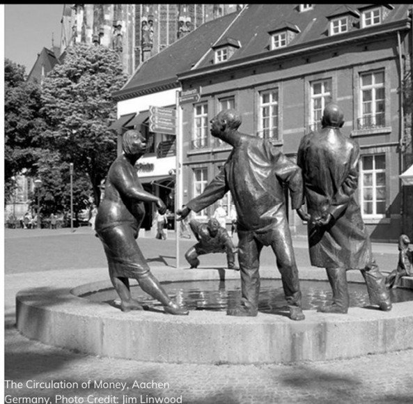
The Circulation of Money, Aachen Germany

FAILURE IS OBVIOUS BUT HOW DO WE MEASURE SUCCESS?